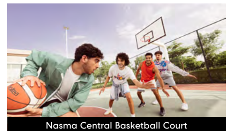
Nasma Central Basketball Court