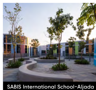
SABIS International School-Aljada