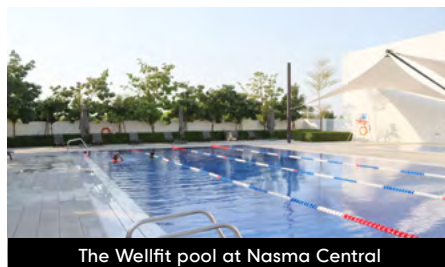
The Wellfit pool at Nasma Central