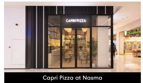
Capri Pizza at Nasma