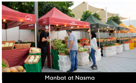
Manbat at Nasma