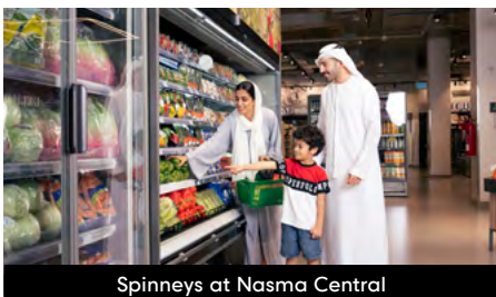
Spinneys at Nasma Central