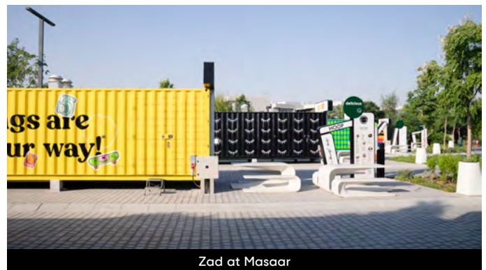
Zad at Masaar

A total of 7 food trucks have opened at Zad's food park at the center of Masaar, these outlets are Krush Burger, Kalakesh Shawarma and The Mighty Meat fast food restaurants, in addition to specialty coffee outlets: Hoop, Retro 7 and Saraya Café, and Boost Juice, the Australian brand's popular juice shop.