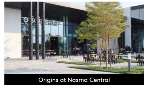
Origins at Nasma Central