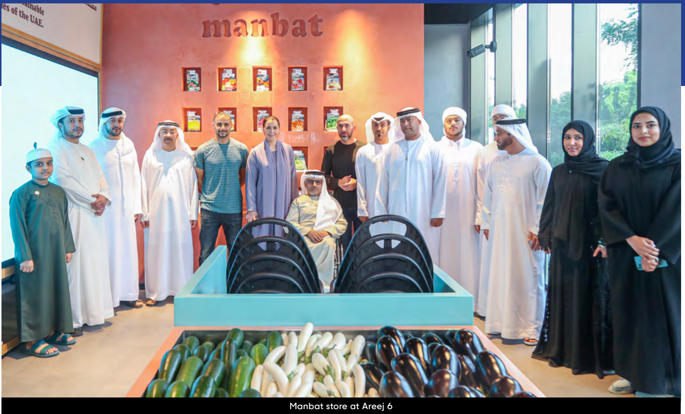
Manbat store at Areej 6