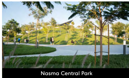
Nasma Central Park