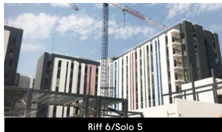
Riff 6/Solo 5