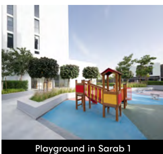
Playground in Sarab 1