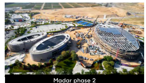
Madar phase 2