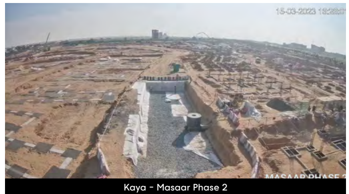
Kaya - Masaar Phase 2