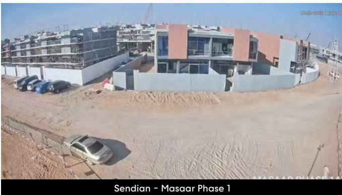
Sendian - Masaar Phase 1